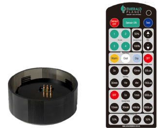
Sensor and Sensor Remote Control sold separately

The optional plug and play motion and daylight sensor offers additional energy-savings, is easily installed (no wiring required) and conveniently controlled from the ground via a remote control.